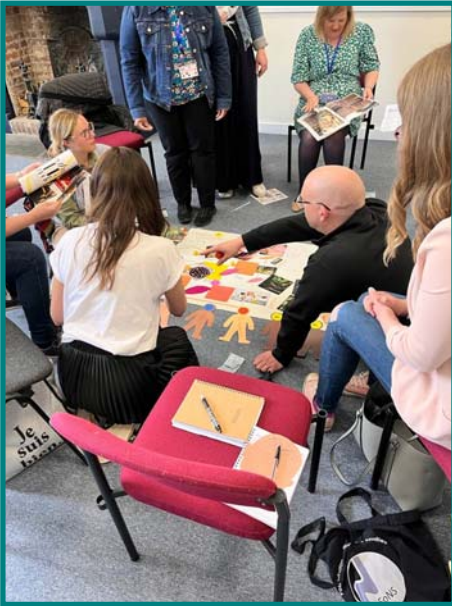
Exploring workplace culture